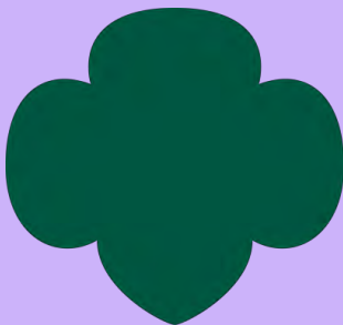
Loading – November 6 th First Year Troop Support Specialist Communities 2, 4, 7, & 8