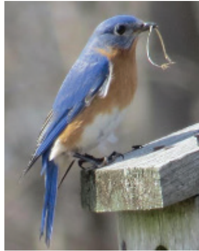
Eastern Blue Bird