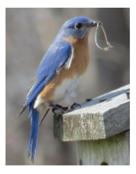
Eastern Blue Bird